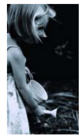
OVER 73 MILLION pounds of pesticides are used in and around our homes each year. <sup>1</sup>

4 QUARTS of used motor oil will contaminate a million gallons of drinking water.<sup>2</sup>