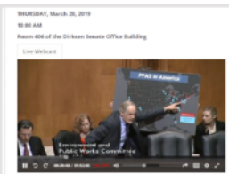
Sen. Carper (D-DE) pointing to our map