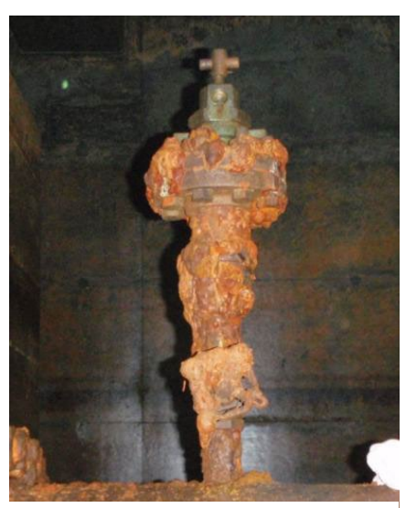
Corroded air valve at Shaft 9A

Each of the existing Metropolitan Tunnels consists of concrete-lined deep rock tunnel sections linked to the surface through steel and concrete vertical shafts. The tunnels and shafts themselves require little or no maintenance and represent a low risk of failure. The shafts are located in Weston, Chestnut Hill, Allston, Somerville, Malden, West Roxbury, and Dorchester. At the top of each shaft, cast iron or steel pipe and valves connect to the MWRA surface pipe network. These pipes and valves are accessed through subterranean vaults and chambers. The piping and many of the valves are in poor condition. Interim improvements as detailed below are being implemented to strengthen the physical assets at top of shaft structures and to provide additional flow capacity and redundancy in the event of an emergency due to a tunnel failure.