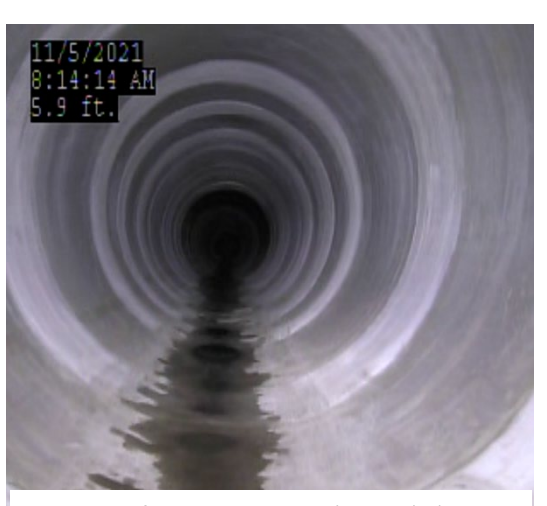
WASM 3 Cleaned and Lined Piping

3. Weston Aqueduct Supply Main (WASM) 3 Rehabilitation - This ten-mile steel pipe, installed in the 1920s and 1930s, is a critical supply line to over 250,000 customers in the Northern High, Northern Extra High, and Intermediate High supply systems. In the event of a loss of the City Tunnel or City Tunnel Extension, this large pipeline can provide emergency flow to the Gillis Pump Station, which would serve the Northern High and Northern Intermediate High communities. The first of two contracts is currently in construction that will rehabilitate over 2.5 miles of 56-inch and 60-inch piping at an estimated cost of $19,487,850. Construction is