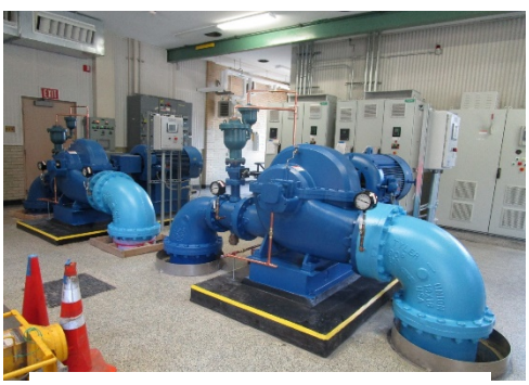
New Pumps Commonwealth Avenue

1. Commonwealth Avenue Pumping Station Improvements – This project added pumps and piping to provide a means of supply independent of the City Tunnel, by adding a pipeline connection to MWRA's Low Service system and two new pumps capable of pumping from the Low Service grade line. This project was completed in July 2021 at a final cost of $7,977,169.