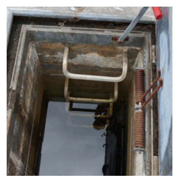
Flooded Shaft 7D valve chamber

2. Tunnel-shaft Pipeline Improvements – Modifications are being implemented to protect the valves and piping in the chambers at the tops of the tunnels shafts and to reduce water infiltration that is contributing to corrosion and can require significant pumping in order to access valves for operation. Construction was recently completed at Shafts 6, 8, and 9A at a cost of $2,391,500 that provided protection of all exposed piping, shaft caps, end caps, nuts, bolts, and valve bodies with corrosion protection tape or exterior carbon fiber wrapping; removed and replaced corroded nuts and bolts; and reduced or eliminated water infiltration in eight vaults through waterproofing and grouting. Improvements for Shaft 5 are currently in