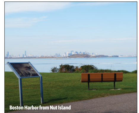
Boston Harbor from Nut Island