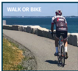
WALK OR BIKE

Alcoholic beverages, camping, open flames, motorized or self-propelled vehicles (except motorized wheelchairs) and skateboards are prohibited. At the present time, fishing is permitted along the shoreline of the Public Access area, as well as from the fishing pier.