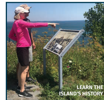
LEARN THE ISLAND'S HISTORY

Deer Island, along with Nut Island in Quincy, became part of the Boston Harbor Islands National Park Area through an Act of Congress. To learn more, visit www.bostonharborislands.org .