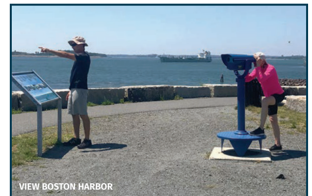
VIEW BOSTON HARBOR

the dirtiest harbor in America to one of the cleanest. Advance reservations are required. Large groups should call well in advance. For more information or to book a tour, please call 617-660-7607.