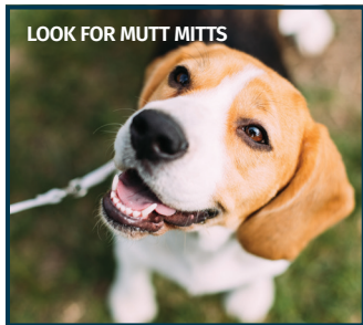
LOOK FOR MUTT MITTS

DEER ISLAND HOTLINE: 617-660-7633 DIHotline@MWRA.com