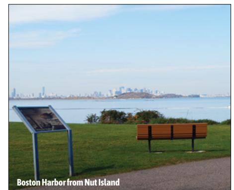
Boston Harbor from Nut Island