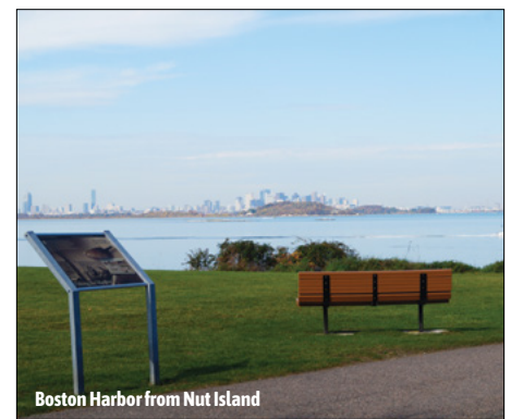
Boston Harbor from Nut Island