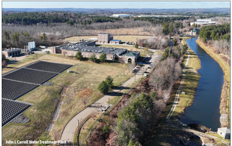
John J. Carroll Water Treatment Plant

The Carroll Treatment Plant is designed with two separate parallel flow paths for redundancy and adaptability. This allows the plant to continue operating even when one half is being maintained or upgraded.