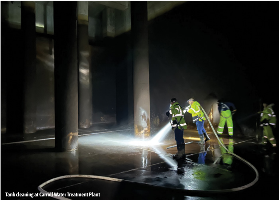
Tank cleaning at Carroll Water Treatment Plant