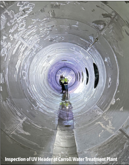
Inspection of UV Header at Carroll Water Treatment Plant