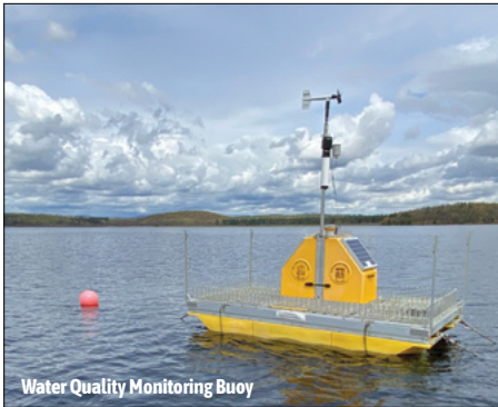
Water Quality Monitoring Buoy