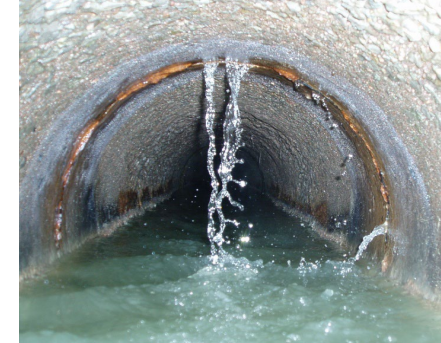
Infiltration in a Sanitary Sewer

<u>Stormwater in Combined Sewers</u> is, by design, collected in the combined sewer system to be transported to a downstream treatment facility. Additional system capacity is available via