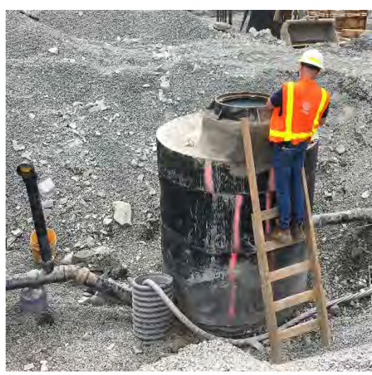
Figure 2. Inspection of a new gas/oil separator.