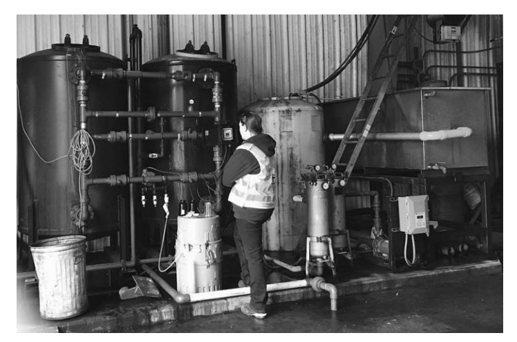
Figure 1. Sample collection at an industry.

Total Industrial Facility visits = 1,395