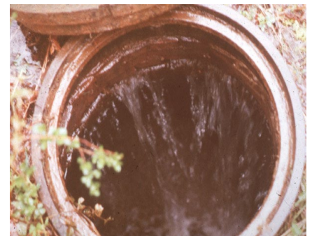
Inflow into a Sewer Manhole

Inflow is extraneous flow entering the collection system through point sources and may be directly related to storm water run-off from sources such as roof leaders, yard and area drains, basement sump pumps, ponded manhole covers, cross connections from storm drains or catch basins, leaking tide gates, etc. Inflow causes a rapid increase in wastewater flow that occurs during and continuing after storms and extreme high tides. The volume of inflow entering a collection system typically depends on the magnitude and duration of rainfall, as well as related impacts from snowmelt, flooding, and storm surge.