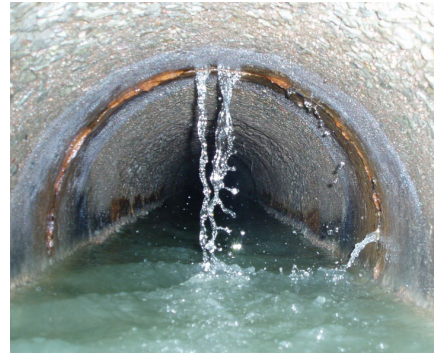
Infiltration into a Sanitary Sewer

Wastewater discharged by member sewer communities to MWRA is influenced by seasonal and wet-weather conditions related to stormwater in combined sewer systems, groundwater infiltration, and stormwater and tidal inflow. Infiltration/Inflow (I/I) is extraneous water that enters all wastewater collection systems through a variety of sources.