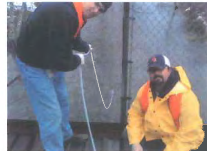
NPDES Permit Sampling in Clinton

Total number of non-industrial events = 1702