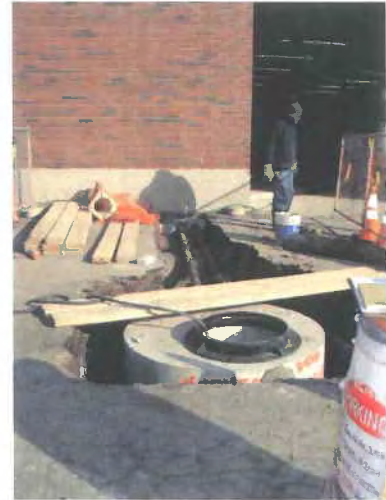
New Trap Inspection