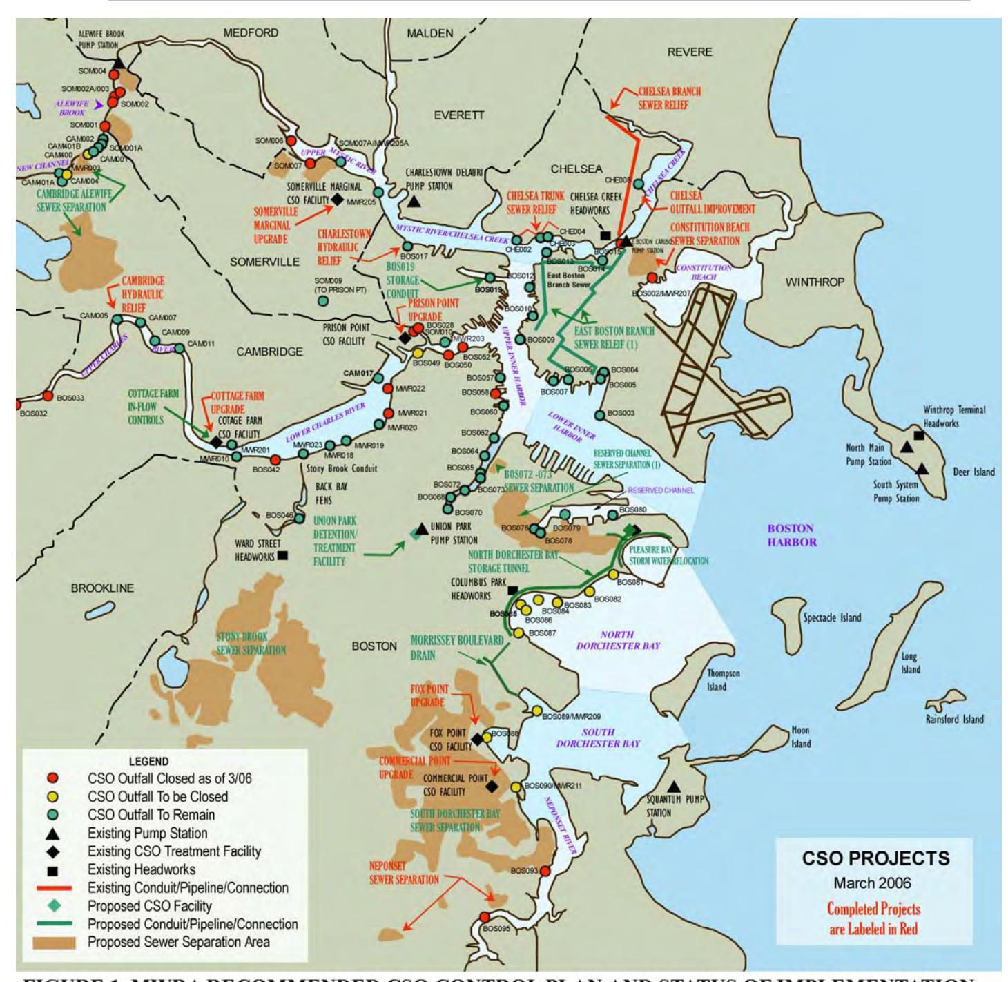
FIGURE 1. MWRA RECOMMENDED CSO CONTROL PLAN AND STATUS OF IMPLEMENTATION