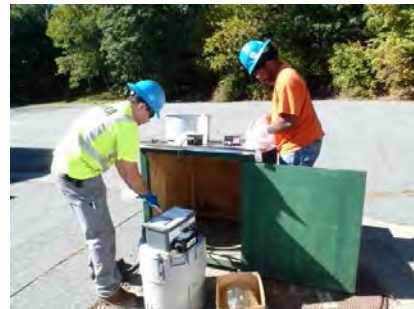
Figure 2- Wastewater characterization sampling

Total number of non-industrial events = 1528